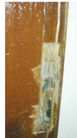
POINT OF ENTRY: The broken lock of the house in Wadi Kabir where burglars entered the expatriate's flat.

"We went out only for a few hours. When we returned by 9pm, we found that the burglars had ransacked our house by tampering with the front door's lock. They had searched our entire